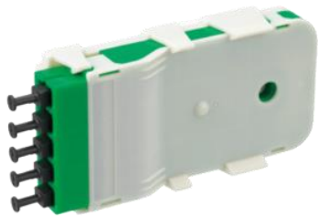
1 x 4 Splitter Module (UPC (top), APC (bottom))