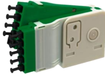
1 x 8 Splitter Module (UPC (top), APC (bottom))