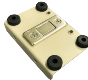
Magnet Base Body